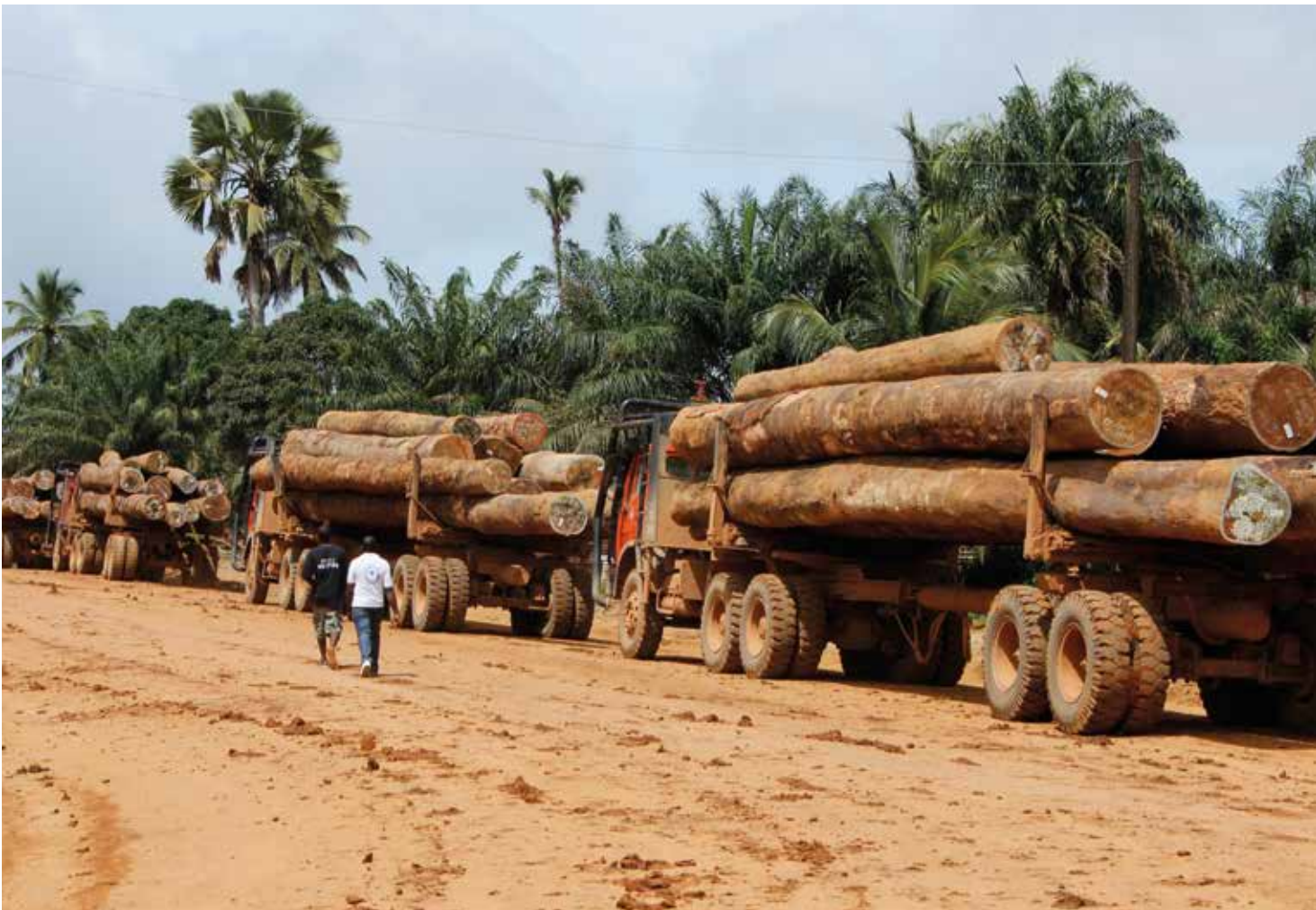
Trucks transporting in Atlantic Resources logyard in Greenville port Liberia.

The VPA partner countries and main exporters of tropical timber to the EU are characterised by high levels of fragility and corruption and have poor ratings when it comes to rule of law and freedom of information and expression. This is illustrated by the chart on the following page which collates the various rankings available. This demonstrates the strong probability that the EU's tropical timber supply chain is contaminated with corruption. It also highlights the importance of ensuring that the EU's policies in the forest sector prioritise the principles and policies that are essential to an effective anti-corruption policy.