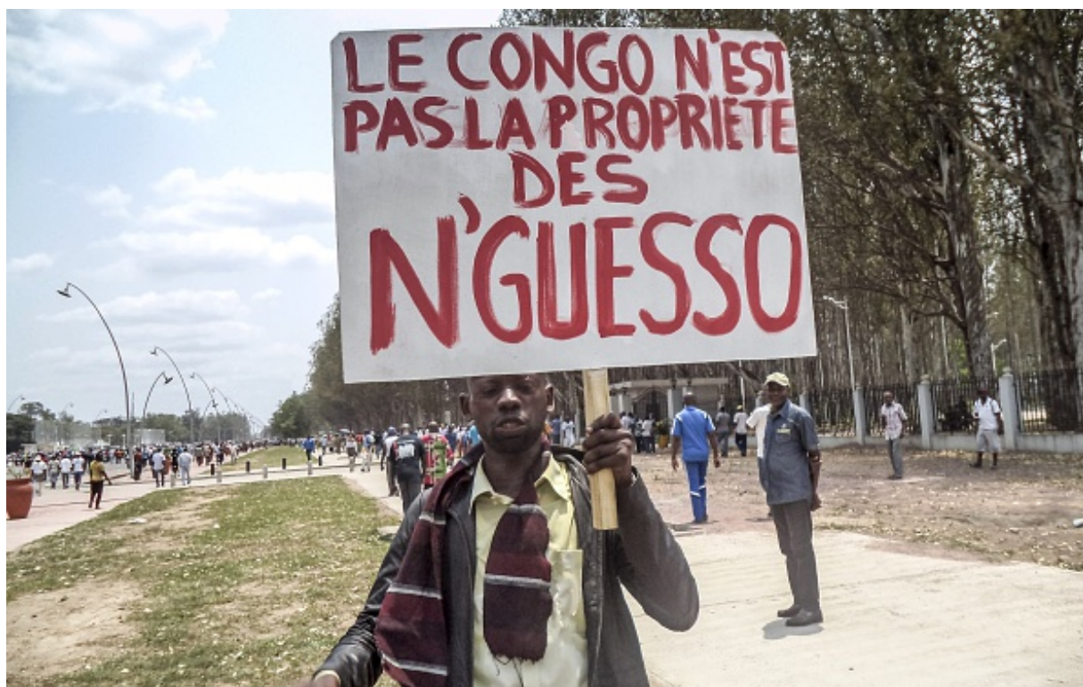
A man holds a placard reading "Congo is not the Sassou Nguessos' [private] property" during an opposition protest in Brazzaville in 2015.

*The Florida complaint was filed on behalf of the United States of America by attorneys in the money laundering and asset recovery section of the US Department of Justice on 12 June 2020. It is a civil application for forfeiture of 900 Biscayne Boulevard, unit #6107.