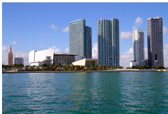
Denis Christel allegedly used embezzled and laundered public funds to purchase multi-million dollar real estate, including on Biscayne Boulevard in Miami, pictured above.

Global Witness wrote to Denis Christel for comment, directly and via the Congolese government's spokesperson, but did not receive a response.