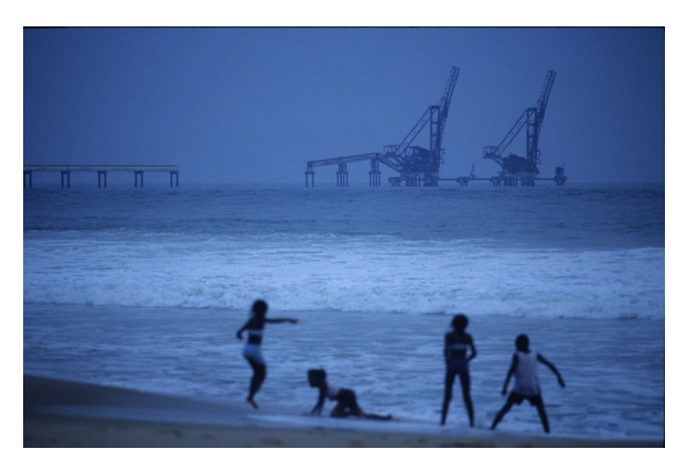
The recent oil price shock and Covid-19 pandemic have sent Congo's already struggling economy deeper into crisis, straining its under-resourced healthcare system.

European jurisdictions and companies are a core part of Copremar and Socotram's business model.